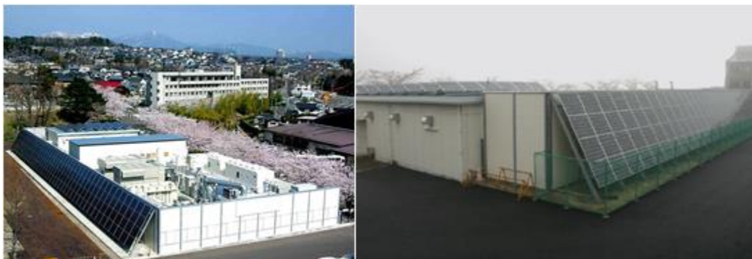
Figure 2 - Left: Sendai Microgrid Energy Center - Right: Sendai Microgrid during the 2011 disaster

microgrids more clearly, at least for the purpose of this article, it is important to understand that an on-site, genset-based power generation system, and/or what is commonly known as an uninterruptable power supply (UPS), may not be qualified as a microgrid. Those systems could provide an alternative solution to the similar power outage issues mentioned earlier; yet, their applications are limited to the single purpose of local load supply that is just one of the many features of microgrids. The concept of microgrid extends beyond the electricity requirements and can consider heat and thermal energy needs of the users, as well.